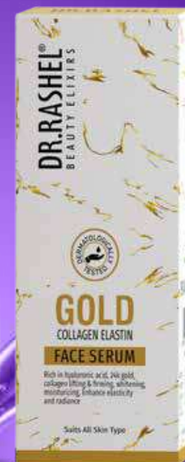
GOLD FACE SERUM