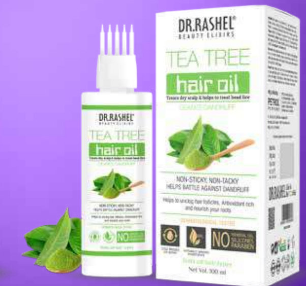
TEA TREE HAIR OIL