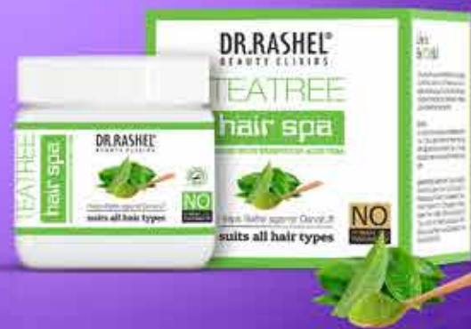
TEA TREE HAIR SPA