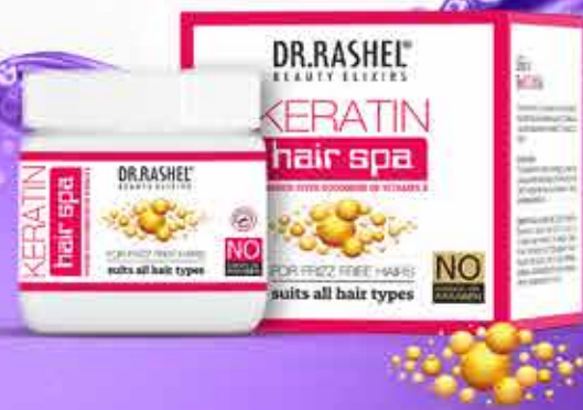
KERATIN HAIR SPA