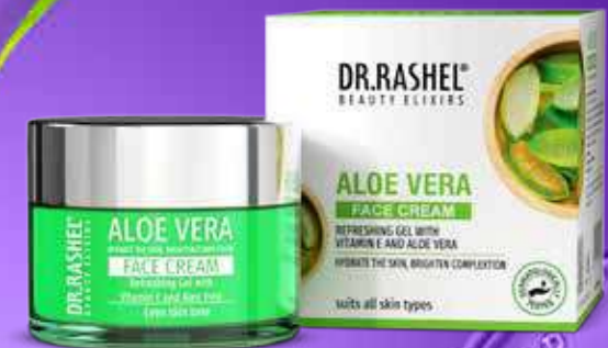
ALOE VERA DAY AND FACE CREAM