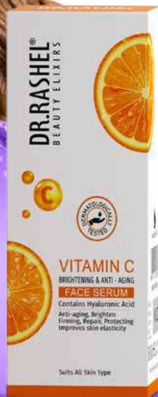
VITAMIN C FACE SERUM