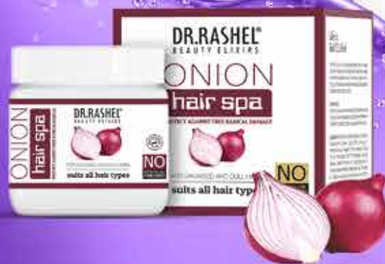
ONION HAIR SPA