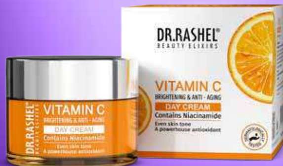
VITAMIN C DAY CREAM