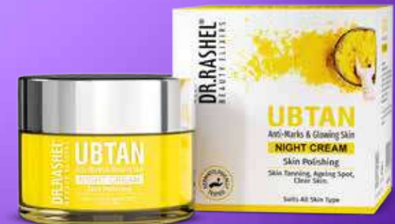
UBTAN DAY AND NIGHT CREAM