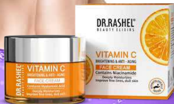
VITAMIN C FACE CREAM