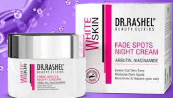
WHITE SKIN DAY AND NIGHT CREAM