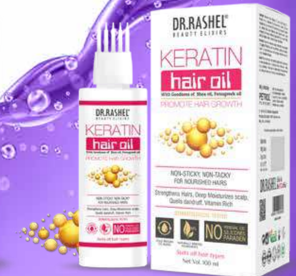
KERATIN HAIR OIL