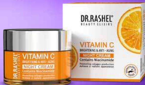
VITAMIN C NIGHT CREAM