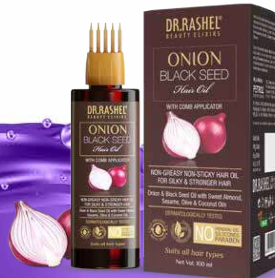
ONION HAIR OIL