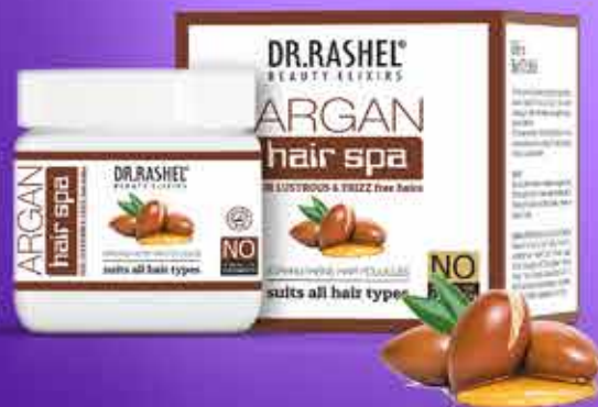
ARGAN HAIR SPA