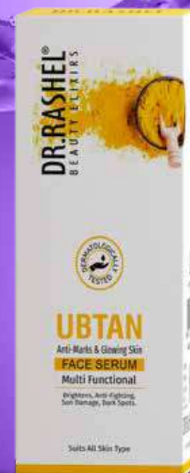
UBTAN FACE SERUM