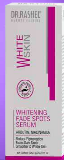
WHITE SKIN FACE SERUM