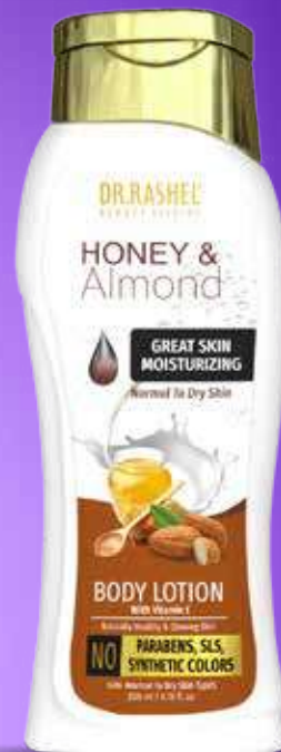
HONEY & ALMOND