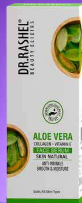
ALOE VERA FACE SERUM