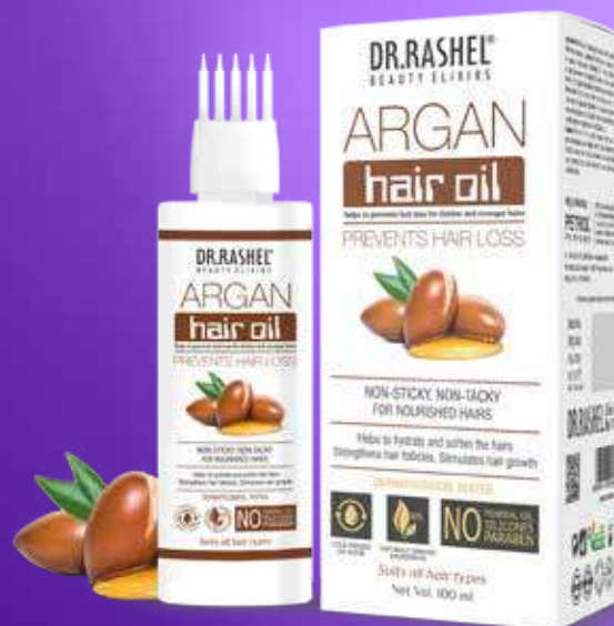
ARGAN HAIR OIL