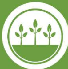
Black Top Roads with Avenue Plantation