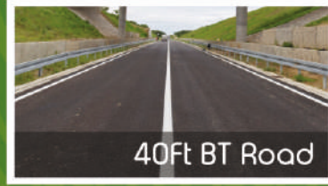
40ft BT Road