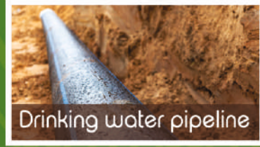
Drinking water pipeline