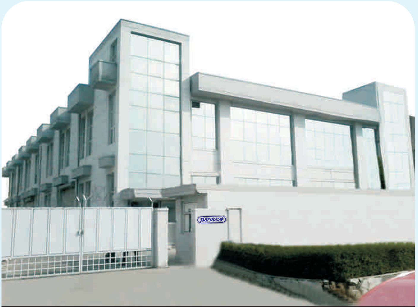
IS : 694 (2010)